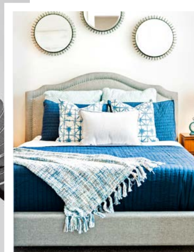
In this bedroom by Niki, a hidden storage unit is tucked under the mattress platform.