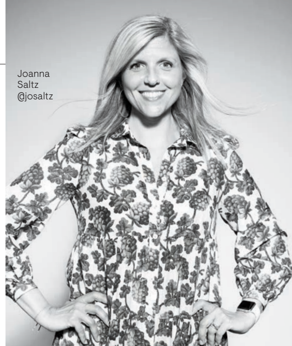
Want to talk? E-mail me at editor@housebeautiful.com.