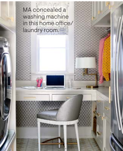
MA concealed a washing machine in this home office/laundry room.

Joanna Saltz: Spaces seem to work so much harder than they used to. Do the rooms you design these days have to function in more than one way?